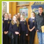
Consultation and on-going work - July 2011